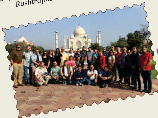
Visit of participants of 3rd Special Course for Diplomats from Syria and 4th Special Course for Iraq to Taj Mahal, Agra