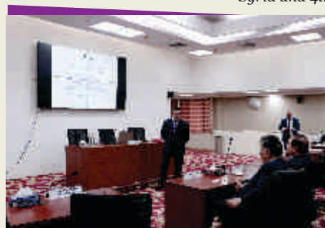
Country presentation by Iraqi diplomats