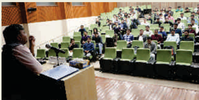
Induction Training Programme for Direct Recruit ASOs in progress