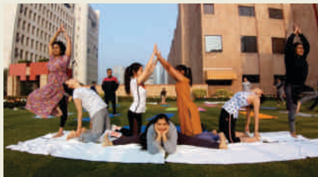
Diplomats from BIMSTEC Countries participated in Yoga Session