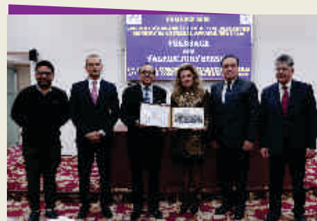
Valedictory session of 3rd Special Course for Diplomats from Syria and 4th Special Course for Diplomats from Iraq.