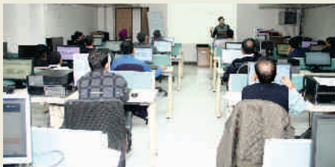
Participants of IVFRT undergoing hands-on training