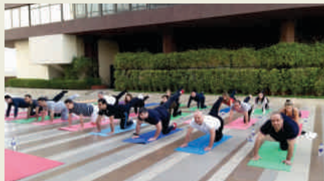
Diplomats from Syria and Iraq participated in Yoga Session