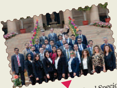
Visit of participants of 3rd Special Course for Diplomats from Syria and 4th Special Course for Iraq to Rashtrapati Bhavan