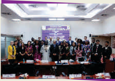
Valedictory session of 2nd Annual D&ISA Fellowship Programme