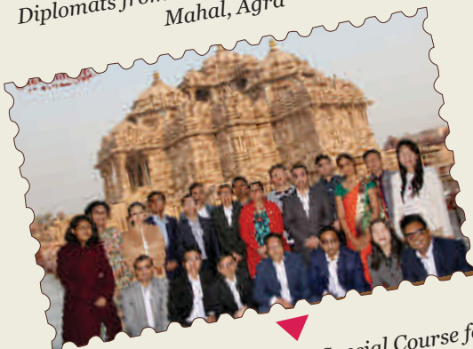
Visit of participants of 1st Special Course for Diplomats from BIMSTEC Countries to Akshardham, New Delhi