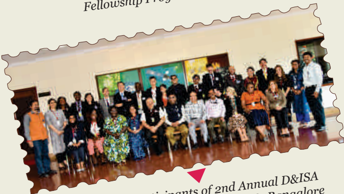
Visit of participants of 2nd Annual D&ISA Fellowship Programme to ISRO, Bangalore