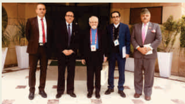
Dr. Seyed Kazem Sajjadpour, Deputy Foreign Minister of Iran visited SSIFS on 16 January 2020 to discuss training of Iranian diplomats at SSIFS.