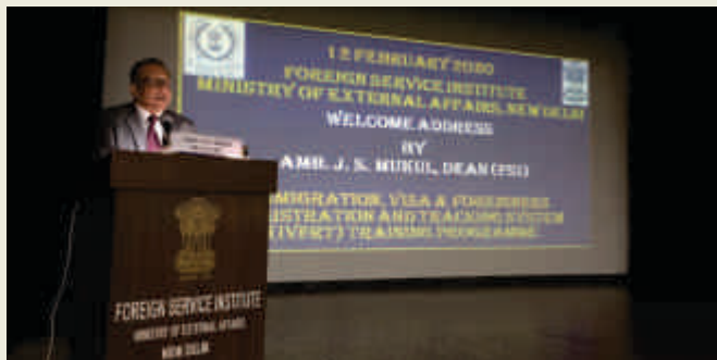
Dean (SSIFS) welcoming participants of IVFRT Training