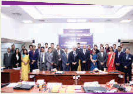
Valedictory session of 1st Special Course for Diplomats from BIMSTEC Countries