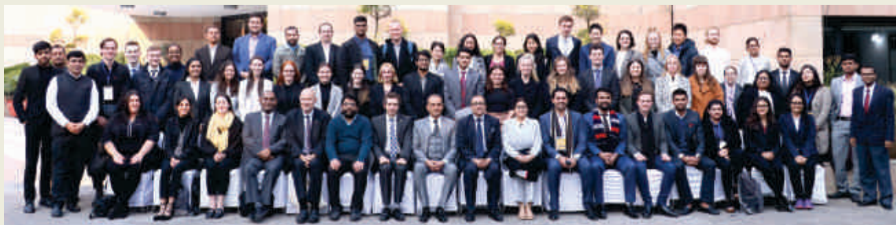
The faculty & students from Australian Universities (Deakin, La Trobe, Monash, Murdoch, RMIT, New England, New South Wales & Wollongong) and O.P. Jindal Global University, Gurgaon visited SSIFS on 10 January 2020.