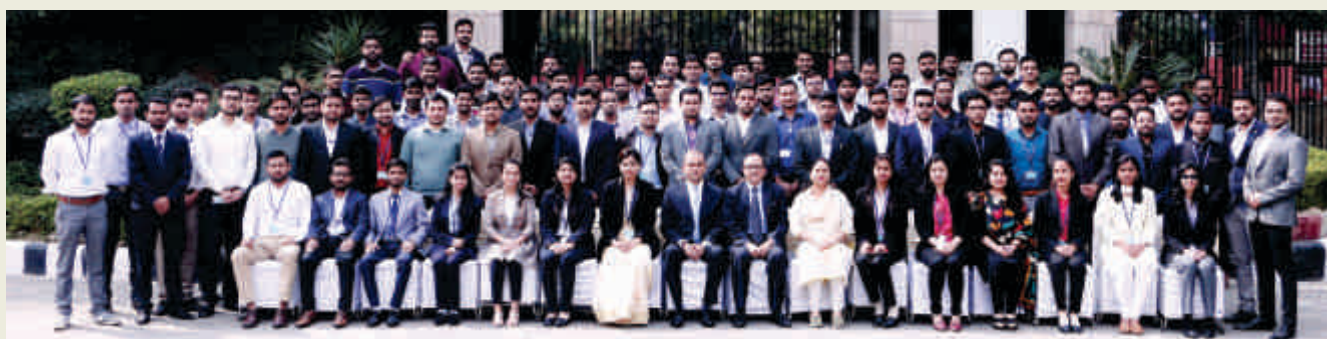
Induction Training Programme for 92 new Direct Recruit ASOs was organised at SSIFS.