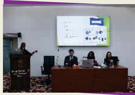
Country presentation by participants of 2nd Annual D&ISA Fellowship Programme