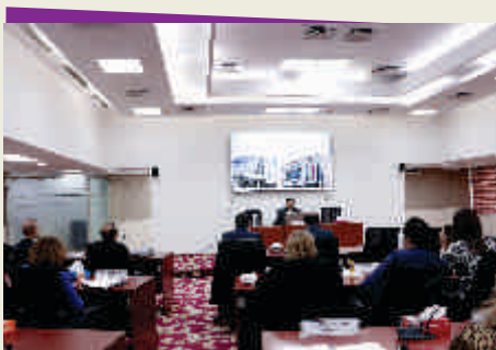
Country presentation by Syrian diplomats