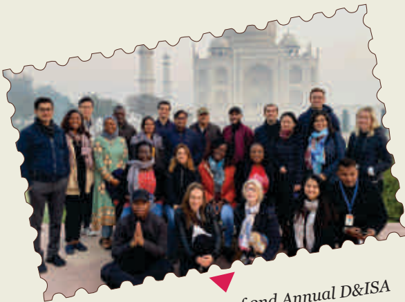
Visit of participants of 2nd Annual D&ISA Fellowship Programme to Taj Mahal, Agra