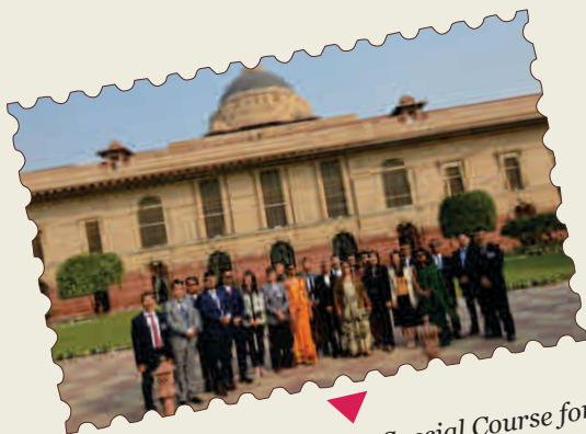
Visit of participants of 1st Special Course for Diplomats from BIMSTEC Countries to Rashtrapati Bhavan