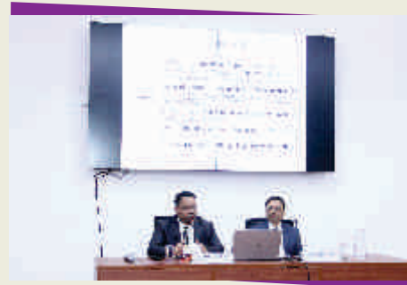
Country presentation by BIMSTEC Secretariat diplomats