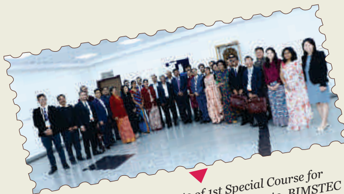
Visit of participants of 1st Special Course for Diplomats from BIMSTEC Countries to BIMSTEC Centre for Weather and Climate, Noida