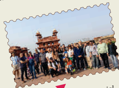
Visit of participants of 3rd Special Course for Diplomats from Syria and 4th Special Course for Iraq to Fatehpur Sikri