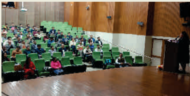
IVFRT Session in progress