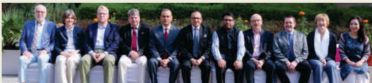
Professors from German Universities visited SSIFS on 2 March 2020 and interacted with Dean (SSIFS).