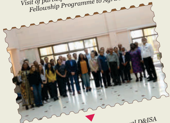
Visit of participants of 2nd Annual D&ISA Fellowship Programme to Department of Atomic Energy, Mumbai