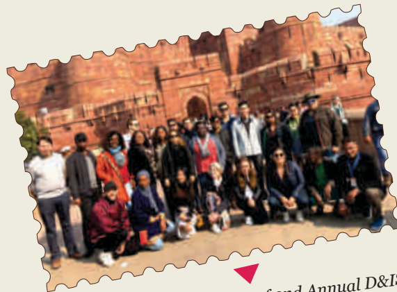
Visit of participants of 2nd Annual D&ISA Fellowship Programme to Agra Fort